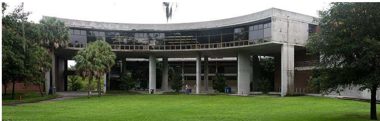
Architecture Building from the Front Lawn